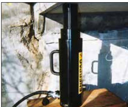
◀ The portable lock nut cylinder RACL-1506 used for extended load supports during epoxy injection for bridge reinforcement.